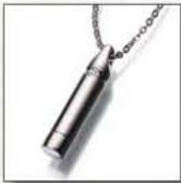
#118TT Cylinder w/ Crystal Chip - $330 5/16"W x 1-5/16"H 24" Titanium Chain Included