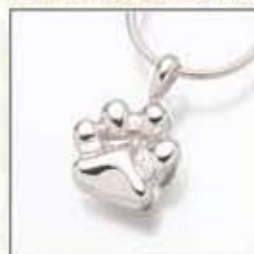
#166GV Paw - $160 #166SS Paw - $140 ** #166YG Paw - Call 5/8"W x 5/8"H