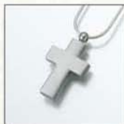
#112PT Satin Finish Cross - $90 7/8"W x 1-1/4"H