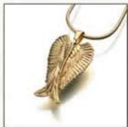
#185GV Angel Wings - $220 #185SS Angel Wings - $200 #185SS-A Antiqued Angel Wings - $200 ** #185YG Angel Wings - Call 13/16"W x 1-3/16"H