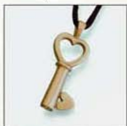
#218BR Satin Finish Key to My Heart - $110 #218WB Satin Finish Key to My Heart - $110 5/8"W x 1-1/4"H

All items pictured not actual size. Measurements do not include the bales. All chains and leather cord sold separately. Satin cord included with all orders.