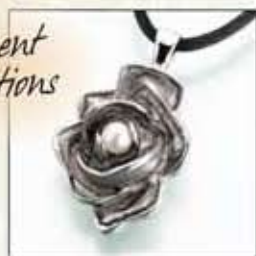
#224PT-A Antique Pewter Rose w/ Pearl - $110 #225PT Pewter Rose w/ Pearl - $110 7/8"W x 1-1/8"H x 3/8"D