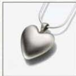
#111WB Heart - $90 15/16"W x 15/16"H