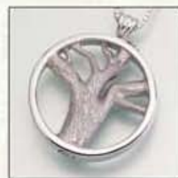
#205SS 4-chamber Tree of Lives - $270 1-1/4" Diameter x 1/4" Deep Not available in Gold Vermeil 14K Special Order - Call