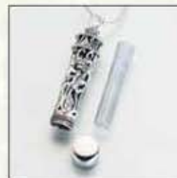
#127SS-A & #127SS-A (shown above) Removable Glass Casing w/ threaded end cap closure allows easy filling with lock of hair or other memory.