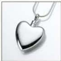
#106GV Large Heart - $230 #106SS Large Heart - $210 **#106YG Large Heart - Special Order 1-5/16"W x 1-5/16"H