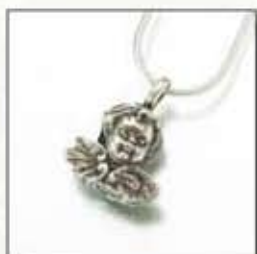
#123BR Antiqued Cherub - $90 #123WB Antiqued Cherub - $90 13/16"W x 3/4"H