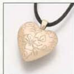
#149BR Floral Heart - $110 15/16"W x 15/16"H