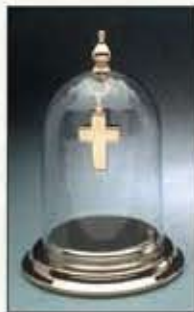
#137GV Blown Glass Dome, Gold Overlay Base - $100 4" round x 6" high (Pendant sold separately)