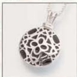
#160SS Filigree Round - $220 ** #160YG Filigree Round - Call 7/8"W x 7/8"H