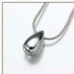
#121GV Slide Tear Drop - $180 #121SS Slide Tear Drop - $160 ** #121YG Slide Tear Drop - Call 7/16"W x 7/8"H