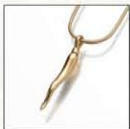
#186GV Italian Horn - $160 #186SS Italian Horn - $140 ** #186YG Italian Horn - Call 3/16"W x 1-1/8"H