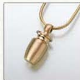
#115 Brass Small Urn - $90 #115SS Small Urn - $150 ** #115YG Small Urn - Call 7/16"W x 11/16"H