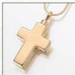
#101GV Large Cross - $220 #101SS Large Cross - $190 **#101YG Large Cross - Special Order 1-1/16"W x 1-1/2"H