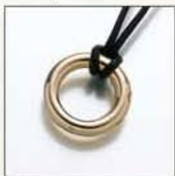
#180GV Eternity - $240 #180SS Eternity - $210 **#180YG Eternity - Call 1" Diameter Circle

All items pictured not actual size. Measurements do not include the bales. All chains and leather cord sold separately. Satin cord included with all orders.