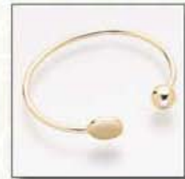
#214SS Bangle Bracelet - $280 #214YG Bangle Bracelet - Call Ball - 1/2" x 5/8"

Smaller-sized pendants can be attached to double-link bracelets. Pendants sold separately.