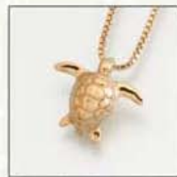
#157GV Turtle - $180 #157SS Turtle - $160 **#157YG Turtle - Call 3/4"W x 3/4"H