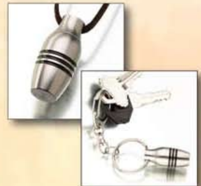
#193ST Urn Pendant w/ Key Chain and 35"L suede leather cording - $150 9/16"W x 1-13/16"H

Sliding double screwed back panel for easy filling. Beveled edge on sides of pendant.