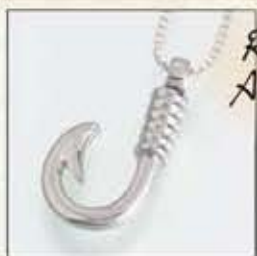
#228SS Sterling Silver Fish Hook - $140 #228YG 14K Yellow Gold Fish Hook - Call 5/8"W x 7/8"H x 1/4"D