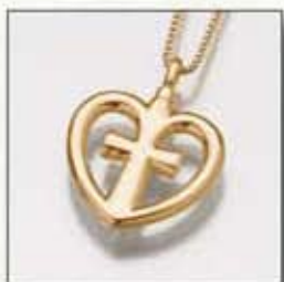
#198GV Love Cross - $190 #198SS Love Cross - $170 ** #198YG Love Cross - Call 1"W x 1"H x 3/16"D