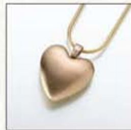
#111BR Satin Finish Heart - $90 15/16"W x 15/16"H