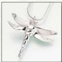
#163GV Dragonfly - $190 #163SS Dragonfly - $160 **#163YG Dragonfly - Call 1-5/8"W x 1-1/4"H x 5/16"D