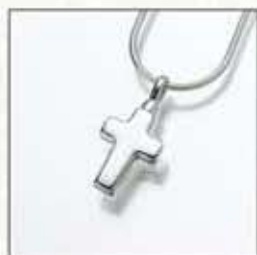
#102GV Small Cross - $170 #102SS Small Cross - $140 ** #102YG Small Cross - Call 9/16"W x 13/16"H