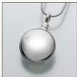
#116SS Large Round - $210 **#116YG Large Round - Special Order 1-1/8"W x 1-1/8"H x 1/2"D