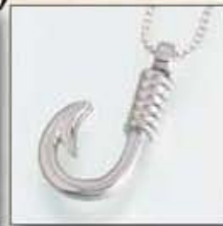
#228SS Sterling Silver Fish Hook - $140 #228YG 14K Yellow Gold Fish Hook - Call 5/8"W x 7/8"H x 1/4"D