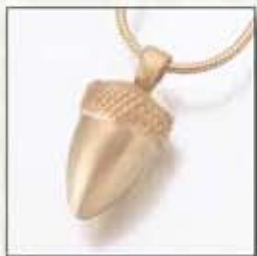
#155BR Acorn - $90 #155SS Acorn - $150 #155GV Acorn - $170 1/2"W x 3/4"H