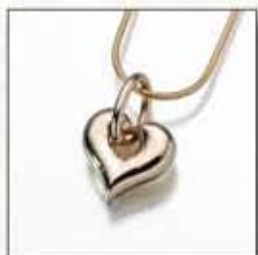
#184GV Puff Heart - $220 #184SS Puff Heart - $200 ** #184YG Puff Heart - Call 13/16"W x 3/4"H