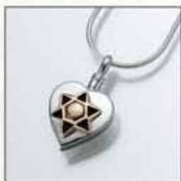
#119SK Heart w/ Star of David Inset - $350 #119SS Star of David Heart- $160 ** #119YG Star of David Heart- Call 13/16"W x 13/16"H