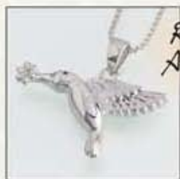
#110SS Sterling Silver Flat Hummingbird w/ Flower - $140 #110YG 14K Yellow Gold Flat Hummingbird w/ Flower - Call 1-1/4"W x 5/8"H x 1/4"D