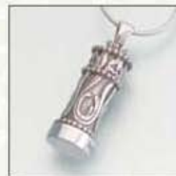
#190SS-C Small Filigree Cylinder - $180 1/2"W x 1-1/8"H