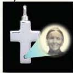
#151SS Large Cross w/ Lens - $450 1-1/16"W x 1-1/2"H

Hand-crafted lens magnifies image 160 times