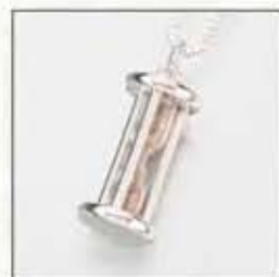
#200SS "Our" Glass - $252 1/2"W x 15/16"H