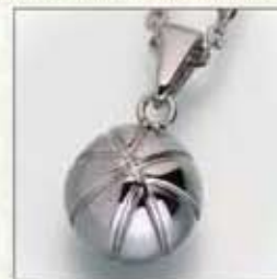
#209ST Basketball w/chain - $170 1/2"W x 1/2"H