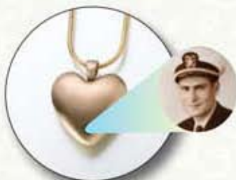
#150BR Heart w/ Lens - $350 15/16"W x 15/16"H