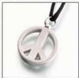
#201PT Peace Sign - $90 15/16"W x 15/16"H