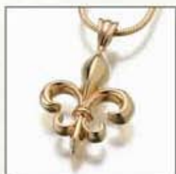
#192GV Fleur de Lis - $180 #192SS Fleur de Lis - $160 ** #192YG Fleur de Lis - Call 7/8"W x 1" H x 1/4" D