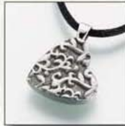
#220PT-A Pewter Heart w/ Antique Filigree - $110 #220PT Pewter Heart w/ Filigree - $110 3/4"W x 3/8"H x 3/16"D