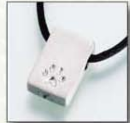
#229SS Sterling Silver Rectangle Pendant w/ Paw Print - $160 #229YG 14K Yellow Gold Rectangle Pendant w/ Paw Print - Call 1/2"W x 3/4"H x 1/4"D