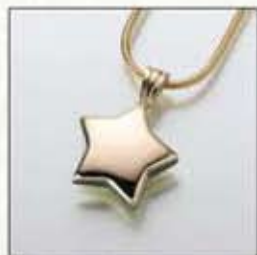
#133GV Small Star - $160 #133SS Small Star - $140 ** #133YG Small Star - Call 3/4"W x 3/4"H