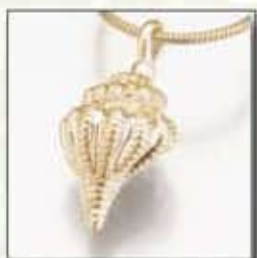
#197GV Conch Shell - $170 #197SS Conch Shell - $150 **#197YG Conch Shell - Call 5/8"W x 3/4"H