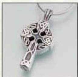
#203GV Celtic Cross - $220 #203SS Celtic Cross - $190 #203YG Celtic Cross - Call 3/4"W x 1-3/16"H x 1/4" Deep