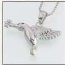
#110SS Sterling Silver Flat Hummingbird w/ Flower - $140 #110YG 14K Yellow Gold Flat Hummingbird w/ Flower - Call 1-1/4"W x 5/8"H x 1/4"D