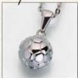
#206ST Soccer Ball w/chain - $170 1/2"W x 1/2"H

24" Stainless Steel chains are included with each sport pendant.