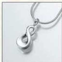
#171GV Infinity - $200 #171SS Infinity - $180 ** #171YG Infinity - Call 1/2"W x 7/8"H