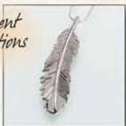
#227SS Sterling Silver Feather - $200 #227YG 14K Yellow Gold Feather - Call 9/16"W x 1-1/2"H x 1/4"D