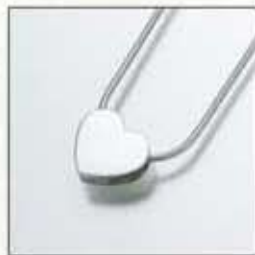
#130GV Sliding Heart - $150 #130SS Sliding Heart - $140 **#130YG Sliding Heart - Call 5/8"W x 5/8"H x 3/16"D Double Chamber Option Available