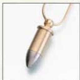
#219BR/WB Bullet - $110 7/16"W x 1-5/16"H