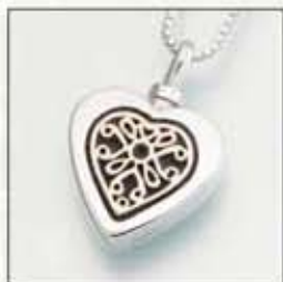
#161SK Heart w/Gold Insert - $410 #161SS Heart w/Sterling Insert - $190 ** #161YG Heart w/Antique Insert - Call 13/16"W x 13/16"H