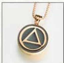
#204GV Serenity - $200 #204SS Serenity - $180 #204YG Serenity - Call 3/4"Diameter x 1/4" Deep