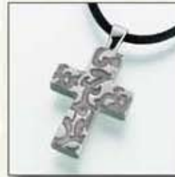
#222PT-A Pewter Cross w/ Antique Filigree - $110 #223PT Pewter Cross w/ Filigree - $110 3/4"W x 11/16"H x 3/16"D