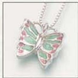
#129SS Butterfly - $220 13/16"W x 11/16"H