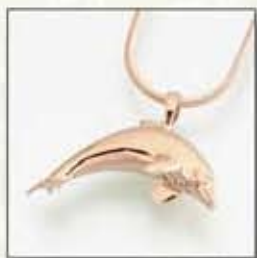
#162GV Dolphin - $190 #162SS Dolphin - $170 **#162YG Dolphin - Call 1-1/8"W x 1/2"H