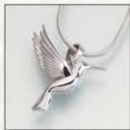
#215SS Hummingbird - $120 **#215YG Hummingbird - Call 3/4"W x 1"H