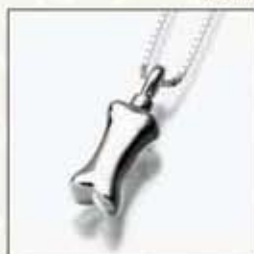
#165GV Dog Bone - $150 #165SS Dog Bone - $130 ** #165YG Dog Bone - Call 3/8"W x 3/4"H