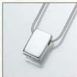
#135GV Slide Rectangle - $180 #135SS Slide Rectangle - $150 ** #135YG Slide Rectangle - Call 1/2"W x 3/4"H x 1/4"D