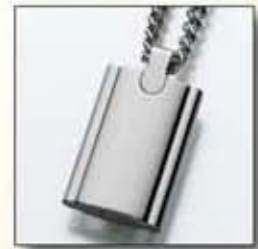
#174ST Flask - $430 1 1/16"W x 1"H 24" Stainless Steel Chain Included