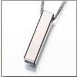
#136TT Long Narrow Sliding Rectangle - $320 5/16"W x 1-5/16"H 24" Titanium Chain Included