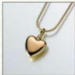
#107GV Small Heart - $180 #107SS Small Heart - $150 ** #107YG Heart - Call 11/16"W x 11/16"H