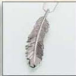
#227SS Sterling Silver Feather - $200 #227YG 14K Yellow Gold Feather - Call 9/16"W x 1-1/2"H x 1/4"D