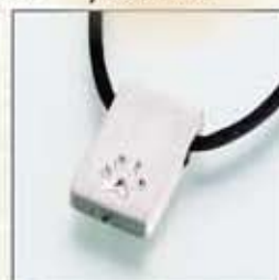
#229SS Sterling Silver Rectangle Pendant w/ Paw Print - $160 #229YG 14K Yellow Gold Rectangle Pendant w/ Paw Print - Call 1/2"W x 3/4"H x 1/4"D