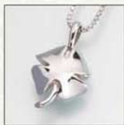
#167GV 4 Leaf Clover - $180 #167SS 4 Leaf Clover - $160 **#167YG 4 Leaf Clover - Call 5/8"W x 3/4"H