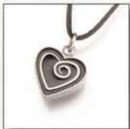
187PT-B Enameled Pewter Satin Finish Black Heart - $90 11/16"W x 11/16"H