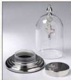
#138GV Fillable Base w/ Glass Dome Top - $150 #138PT Fillable Base w/ Glass Dome Top - $120 4" round x 6" high (Pendant sold separately)