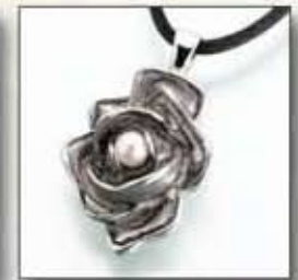
#224PT-A Antique Pewter Rose w/ Pearl - $110 #225PT Pewter Rose w/ Pearl - $110 7/8"W x 1-1/8"H x 3/8"D