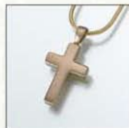
#114 Brass Satin Finish Cross - $90 5/8"W x 1"H