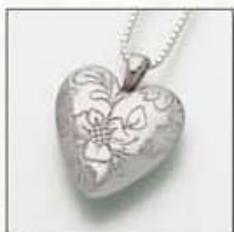
#149WB Floral Heart - $110 15/16"W x 15/16"H