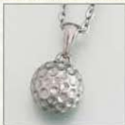
#210ST Golf Ball w/chain - $170 1/2"W x 1/2" H