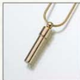
#117BR Cylinder - $90 #117SS Cylinder - $170 ** #117YG Cylinder - Call 1/4"W x 1-1/4"H Double Chamber Option Available