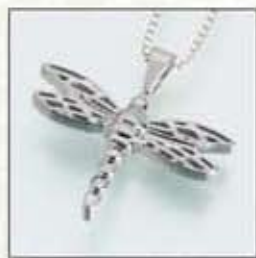
#216SS Small Dragonfly - $130 **#216YG Small Dragonfly - Call 1"W x 11/16"H