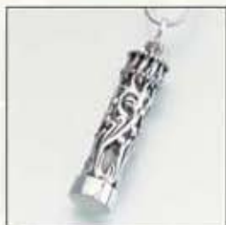
#127SS-A Glass Cylinder Antiqued Filigree Casing - $170