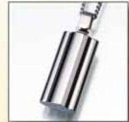
#174ST-N Narrow Flask - $430 1/2"W x 15/16"H 24" Stainless Steel Chain Included