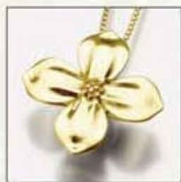
#196GV Dogwood Blossom - $190 #196SS Dogwood Blossom - $170 **#196YG Dogwood Blossom - Call 1-1/4"W x 1-1/4"H x 3/8"D