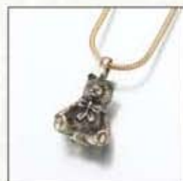
#125BR Antiqued Teddy Bear - $90 #125WB Antiqued Teddy Bear - $90 5/8"W x 3/4"H