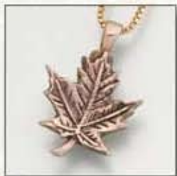
#154BR Antique Maple Leaf - $90 #154SS Maple Leaf - $150 #154GV Maple Leaf - $160 13/16"W x 1"H