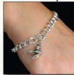
#164SS-B Double Link Bracelet w/jump ring - $60 7mm links, 7" long (jump rings should be soldered)

Hand-crafted lens magnifies image 160 times