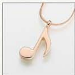
#202GV Music Note - $200 #202SS Music Note - $192 ** #202YG Music Note - Call 3/16"W x 1-3/8"H