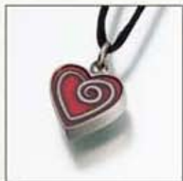
187PT Enameled Pewter Satin Finish Red Heart - $90 11/16"W x 11/16"H