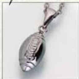
#207ST Football w/chain - $170 3/8"W x 5/8"H