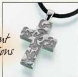
#222PT-A Pewter Cross w/ Antique Filigree - $110 #223PT Pewter Cross w/ Filigree - $110 3/4"W x 11/16"H x 3/16"D