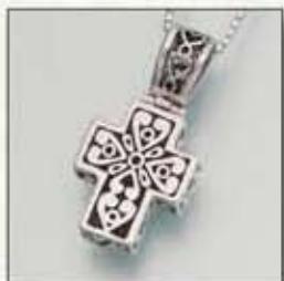
#148GV Antiqued Filigree Cross - $190 #148SS Antiqued Filigree Cross - $170 ** #148YG Antiqued Filigree Cross - Call 5/8"W x 3/4"H x 1/4"D