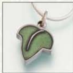
#188PT Enameled Pewter Satin Finish Green Leaf - $90 5/8"W x 11/16"H