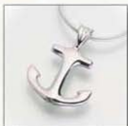
#217SS Anchor - $180 ** #217YG Anchor - Call 13/16"W x 3/4"H