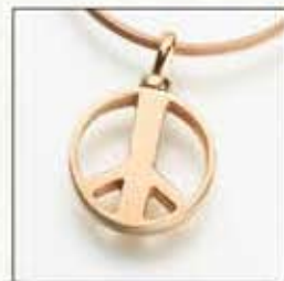
#213GV Peace Sign - $190 #213SS Peace Sign - $160 ** #213YG Peace Sign - Call 3/4"Diameter x 3/16"W