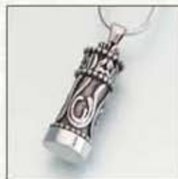
#190SS-A Small Antiqued Filigree Cylinder - $180 1/2"W x 1-1/8"H