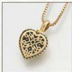
#158GV Filigree Heart - $180 #158SS Filigree Heart - $170 #158YG Filigree Heart - Call 5/8"W x 5/8"H