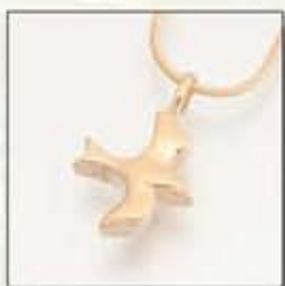
#159GV Dove - $180 #159SS Dove - $160 **#159YG Dove - Call 5/8"W x 3/4"H