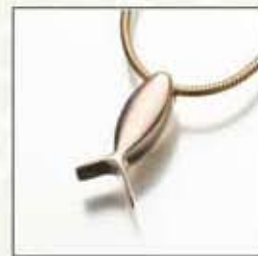
#183GV Fish (Ichthus) - $150 #183SS Fish (Ichthus) - $130 **#183YG Fish (Ichthus) - Call 3/8"W x 3/4"H

All items pictured not actual size. Measurements do not include the bales. All chains and cording sold separately.