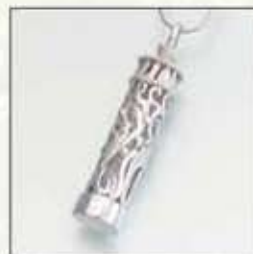
#127SS-C Glass Cylinder/ Filigree Casing - $170 ** #127WG Glass Cylinder/ Filigree Casing - Call 1/2" x 1-7/8"H