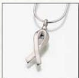
#195GV Remembrance Ribbon - $170 #195SS Remembrance Ribbon - $150 ** #195YG Remembrance Ribbon - Call 7/16"W x 1"H x 3/16" D