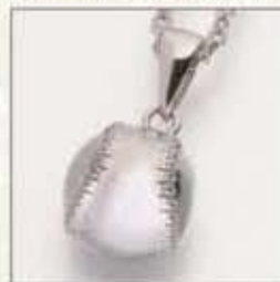
#208ST Baseball w/chain - $170 1/2"W x 1/2"H