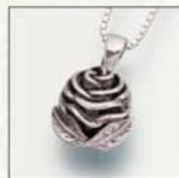
#156SS Rose - $160 **#156YG Rose - Call 5/8"W x 5/8"H