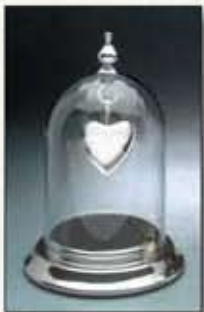
#137PT Blown Glass Dome, Pewter Base - $80 4" round x 6" high (Pendant sold separately)